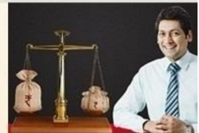
*Service tax extra.

Mr. YOU, at present when you are young, energetic and your income earning capacity is high, we propose that you save Rs. 100,000* every year for the next 10 years in this solution. This solution will provide an umbrella of security to your family by providing you with a life cover for first 20 years of the policy, of Rs. 1,519,278 in 1st policy year and it increases during premium paying term.