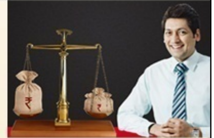
*Service tax extra.

Mr. YOU, at present when you are young, energetic and your income earning capacity is high, we propose that you save Rs. 100,000* every year for the next 10 years in this solution. This solution will provide an umbrella of security to your family by providing you with a life cover for first 20 years of the policy, of Rs. 1,519,278 in 1st policy year and it increases during premium paying term.