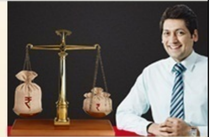
*Service tax extra.

Mr. YOU, at present when you are young, energetic and your income earning capacity is high, we propose that you save Rs. 100,000* every year for the next 10 years in this solution. This solution will provide an umbrella of security to your family by providing you with a life cover for first 20 years of the policy, of Rs. 1,519,278 in 1st policy year and it increases during premium paying term.